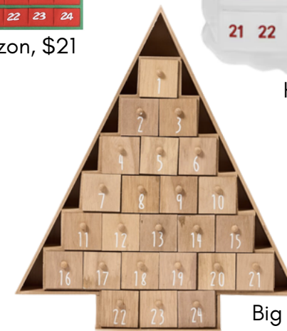
Big W, $40